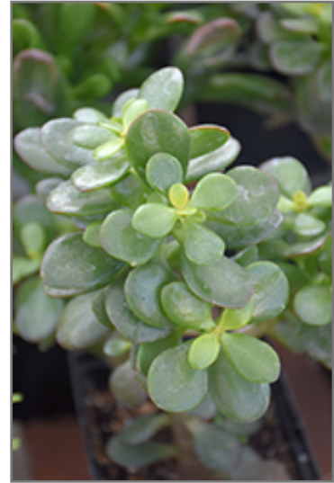
Baby Jade Plant foliage

This is a multi-stemmed evergreen houseplant with an upright spreading habit of growth. This plant can be pruned at any time to keep it looking its best.