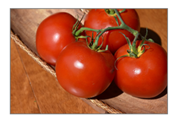
Sweet Cluster Tomato fruit

Sweet Cluster Tomato will grow to be about 5 feet tall at maturity, with a spread of 24 inches. When planted in rows, individual plants should be spaced approximately 24 inches apart. Because of its vigorous growth habit, it may require staking or supplemental support. This fast-growing vegetable plant is an annual, which means that it will grow for one season in your garden and then die after producing a crop.