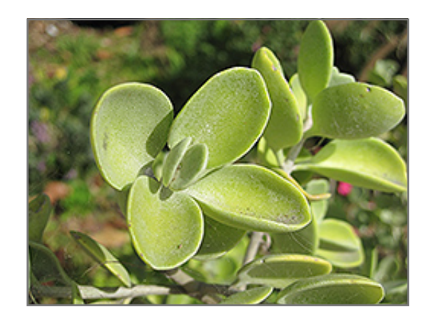
Silver Teaspoons foliage

Silver Teaspoons is recommended for the following landscape applications;