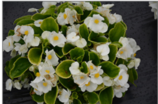
Sprint Plus White Begonia in bloom