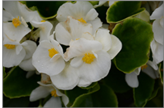
Sprint Plus White Begonia flowers

This is a high maintenance plant that will require regular care and upkeep, and usually looks its best without pruning, although it will tolerate pruning. Deer don't particularly care for this plant and will usually leave it alone in favor of tastier treats. Gardeners should be aware of the following characteristic(s) that may warrant special consideration;