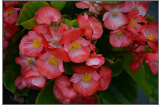
Sprint Plus Blush Begonia flowers

Sprint Plus Blush Begonia is recommended for the following landscape applications;