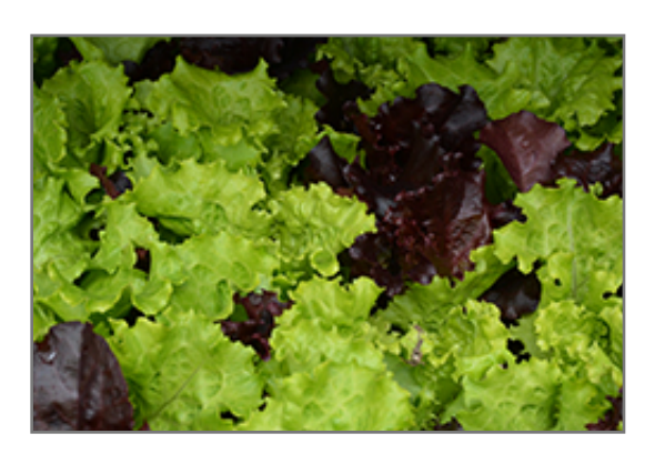
Gourmet Salad Blend Lettuce foliage

This plant is typically grown in a designated vegetable garden. It does best in full sun to partial shade. It does best in average conditions that are neither too wet nor too dry, and is very intolerant of standing water. It is not particular as to soil pH, but grows best in rich soils. It is quite intolerant of urban pollution, therefore inner city or urban streetside plantings are best avoided. This is a selected variety of a species not originally from North America.; however, as a cultivated variety, be aware that it may be subject to certain restrictions or prohibitions on propagation.