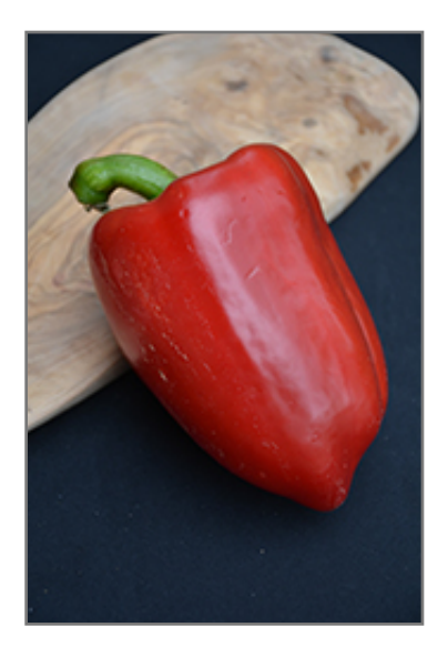
Red Beauty Pepper fruit