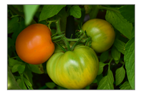
Jubilee Tomato fruit

phone: 847-299-1300 web: www.pesches.com