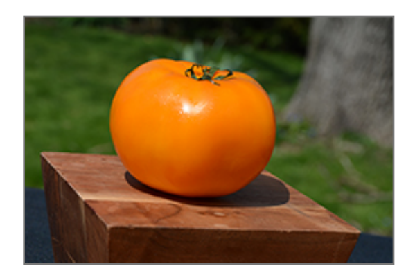
Jubilee Tomato fruit