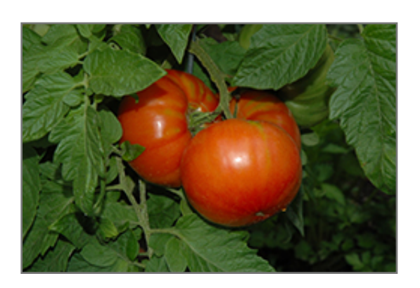
Steakhouse Tomato fruit

Steakhouse Tomato will grow to be about 3 feet tall at maturity, with a spread of 18 inches. When planted in rows, individual plants should be spaced approximately 24 inches apart. Because of its vigorous growth habit, it may require staking or supplemental support. This fast-growing vegetable plant is an annual, which means that it will grow for one season in your garden and then die after producing a crop.