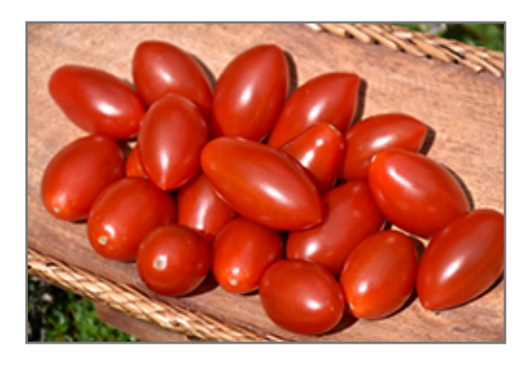
Sugary Tomato fruit

Sugary Tomato will grow to be about 4 feet tall at maturity, with a spread of 24 inches. When planted in rows, individual plants should be spaced approximately 24 inches apart. Because of its vigorous growth habit, it may require staking or supplemental support. This fast-growing vegetable plant is an annual, which means that it will grow for one season in your garden and then die after producing a crop.