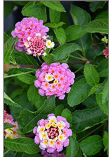
Landscape Bandana Pink Lantana flowers

Landscape Bandana Pink Lantana is recommended for the following landscape applications;