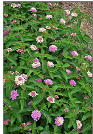
Landscape Bandana Pink Lantana in bloom