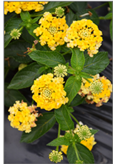
Landscape Bandana Lemon Zest Lantana flowers

Landscape Bandana Lemon Zest Lantana is a fine choice for the garden, but it is also a good selection for planting in outdoor containers and hanging baskets. Because of its spreading habit of growth, it is ideally suited for use as a 'spiller' in the 'spiller-thriller-filler' container combination; plant it near the edges where it can spill gracefully over the pot. Note that when growing plants in outdoor containers and baskets, they may require more frequent waterings than they would in the yard or garden.