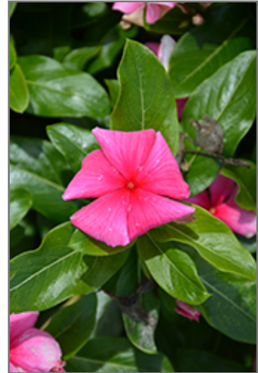
Cora XDR Deep Strawberry flowers

Cora XDR Deep Strawberry is recommended for the following landscape applications;