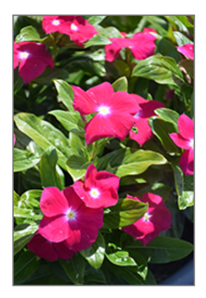
Cora XDR Cranberry flowers

Cora XDR Cranberry is recommended for the following landscape applications;