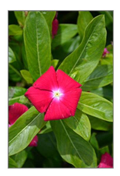
Cora XDR Cranberry flowers