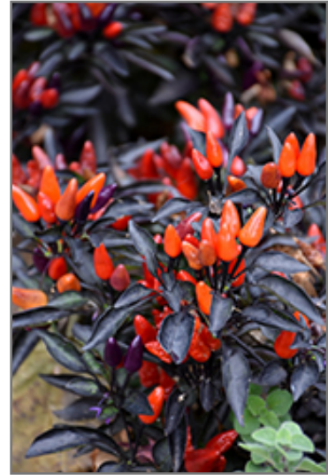
Explosive Ember Ornamental Pepper fruit

Explosive Ember Ornamental Pepper will grow to be about 18 inches tall at maturity, with a spread of 14 inches. When planted in rows, individual plants should be spaced approximately 14 inches apart. This vegetable plant is an annual, which means that it will grow for one season in your garden and then die after producing a crop.