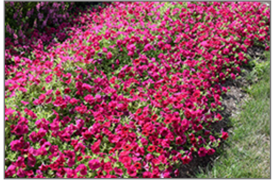
Wave Carmine Velour Petunia in bloom

Wave Carmine Velour Petunia is a fine choice for the garden, but it is also a good selection for planting in outdoor containers and hanging baskets. Because of its spreading habit of growth, it is ideally suited for use as a 'spiller' in the 'spiller-thriller-filler' container combination; plant it near the edges where it can spill gracefully over the pot. Note that when growing plants in outdoor containers and baskets, they may require more frequent waterings than they would in the yard or garden.