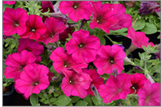
Wave Carmine Velour Petunia flowers

This plant will require occasional maintenance and upkeep. Trim off the flower heads after they fade and die to encourage more blooms late into the season. It is a good choice for attracting hummingbirds to your yard, but is not particularly attractive to deer who tend to leave it alone in favor of tastier treats. It has no significant negative characteristics.