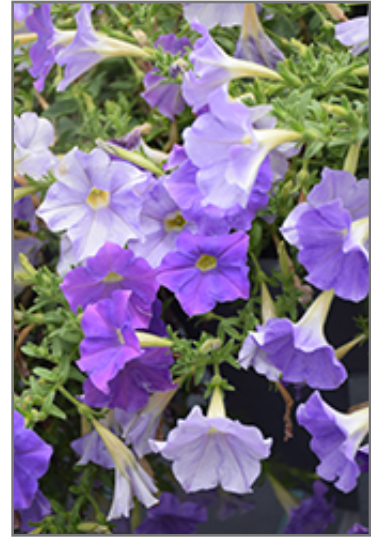
Supertunia Blue Skies Petunia flowers

Supertunia Blue Skies Petunia is recommended for the following landscape applications;