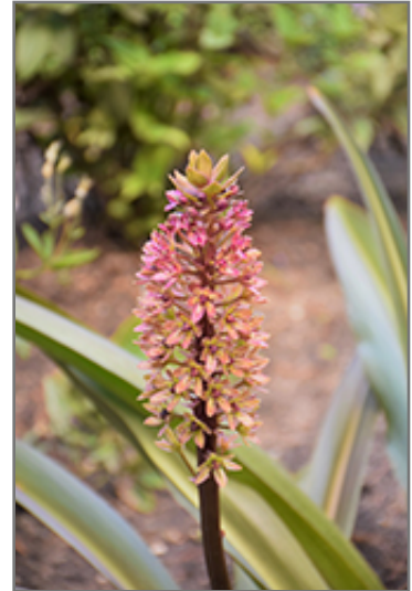
African Night Pineapple Lily flower buds

African Night Pineapple Lily is recommended for the following landscape applications;