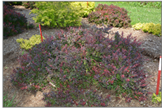
Sunjoy Todo Japanese Barberry

Sunjoy Todo Japanese Barberry will grow to be about 24 inches tall at maturity, with a spread of 24 inches. It tends to fill out right to the ground and therefore doesn't necessarily require facer plants in front. It grows at a medium rate, and under ideal conditions can be expected to live for approximately 20 years.