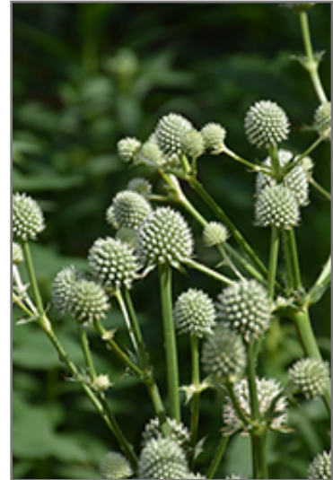
Rattlesnake Master flowers

Rattlesnake Master is recommended for the following landscape applications;