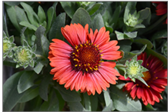
Spintop Red Blanket Flower flowers

Spintop Red Blanket Flower is recommended for the following landscape applications;