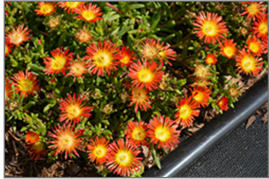
Delmara Red Ice Plant flowers

Delmara Red Ice Plant will grow to be only 4 inches tall at maturity extending to 6 inches tall with the flowers, with a spread of 15 inches. When grown in masses or used as a bedding plant, individual plants should be spaced approximately 12 inches apart. Its foliage tends to remain low and dense right to the ground. It grows at a fast rate, and under ideal conditions can be expected to live for approximately 5 years. As an evergreen perennial, this plant will typically keep its form and foliage year-round.