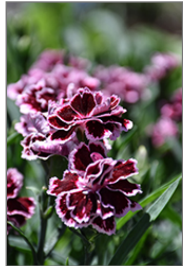
Odessa Pierrot Pinks flowers

Odessa Pierrot Pinks is recommended for the following landscape applications;