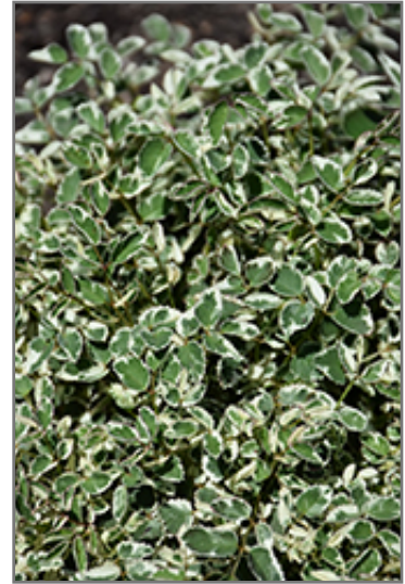
Little Angel Burnet flowers

This plant does best in full sun to partial shade. It prefers to grow in average to moist conditions, and shouldn't be allowed to dry out. It is not particular as to soil type or pH. It is somewhat tolerant of urban pollution. This is a selected variety of a species not originally from North America. It can be propagated by division; however, as a cultivated variety, be aware that it may be subject to certain restrictions or prohibitions on propagation.