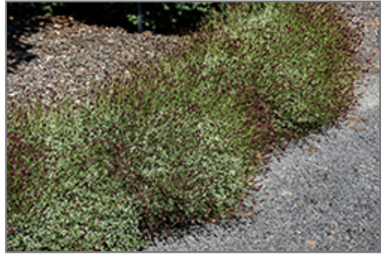
Little Angel Burnet in bloom