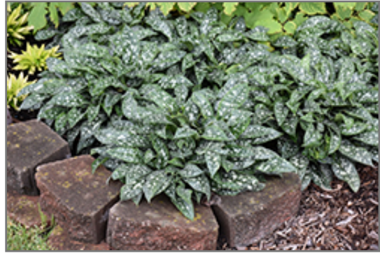
Twinkle Toes Lungwort

Twinkle Toes Lungwort is a fine choice for the garden, but it is also a good selection for planting in outdoor pots and containers. It is often used as a 'filler' in the 'spiller-thriller-filler' container combination, providing a mass of flowers and foliage against which the thriller plants stand out. Note that when growing plants in outdoor containers and baskets, they may require more frequent waterings than they would in the yard or garden.