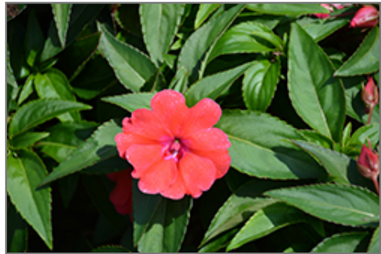
Bounce Bright Coral Impatiens flowers