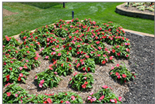
Bounce Bright Coral Impatiens in bloom