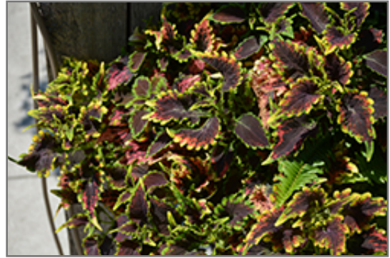
Sky Fire Coleus foliage

Sky Fire Coleus is recommended for the following landscape applications;