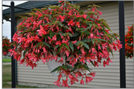
Bossa Nova Pink Glow Begonia in bloom

Bossa Nova Pink Glow Begonia is a fine choice for the garden, but it is also a good selection for planting in outdoor containers and hanging baskets. Because of its trailing habit of growth, it is ideally suited for use as a 'spiller' in the 'spiller-thriller-filler' container combination; plant it near the edges where it can spill gracefully over the pot. Note that when growing plants in outdoor containers and baskets, they may require more frequent waterings than they would in the yard or garden.