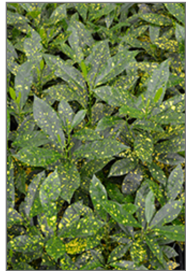
Gold Dust Variegated Croton foliage