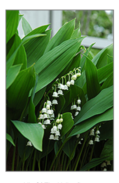
Lily-Of-The-Valley flowers

When grown indoors, Lily-Of-The-Valley can be expected to grow to be about 8 inches tall at maturity, with a spread of 24 inches. It grows at a medium rate, and under ideal conditions can be expected to live for approximately 10 years. This houseplant performs well in both bright or indirect sunlight and strong artificial light, and can therefore be situated in almost any well-lit room or location. It prefers to grow in average to moist soil. The surface of the soil shouldn't be allowed to dry out completely, and so you should expect to water this plant once and possibly even twice each week. Be aware that your particular watering schedule may vary depending on its location in the room, the pot size, plant size and other conditions; if in doubt, ask one of our experts in the store for advice. It is not particular as to soil type or pH; an average potting soil should work just fine. Be warned that parts of this plant are known to be toxic to humans and animals, so special care should be exercised if growing it around children and pets.