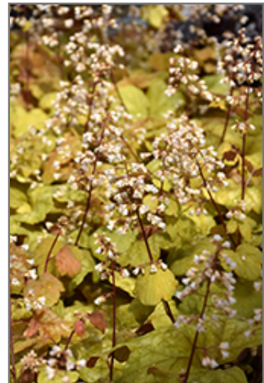
Champagne Coral Bells flowers