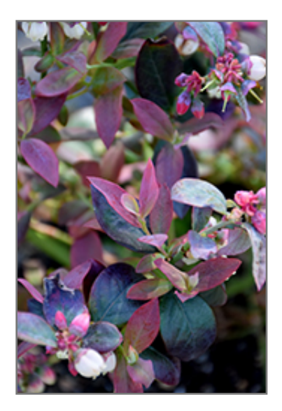
Pink Icing Blueberry foliage