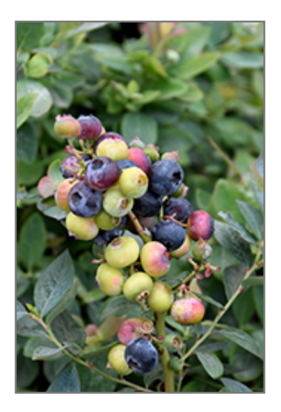
Pink Icing Blueberry fruit

Pink Icing Blueberry features dainty clusters of white bell-shaped flowers with shell pink overtones hanging below the branches in mid spring, which emerge from distinctive pink flower buds. It has bluish-green deciduous foliage which emerges pink in spring. The glossy oval leaves turn an outstanding aqua bluish-green in the fall. It features an abundance of magnificent blue berries in mid summer.