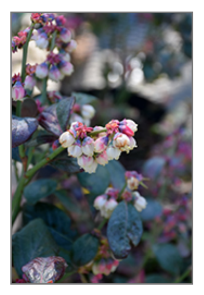
Pink Icing Blueberry flowers

This shrub is quite ornamental as well as edible, and is as much at home in a landscape or flower garden as it is in a designated edibles garden. It does best in full sun to partial shade. It does best in average to evenly moist conditions, but will not tolerate standing water. It is very fussy about its soil conditions and must have sandy, acidic soils to ensure success, and is subject to chlorosis (yellowing) of the foliage in alkaline soils. It is quite intolerant of urban pollution, therefore inner city or urban streetside plantings are best avoided, and will benefit from being planted in a relatively sheltered location. Consider applying a thick mulch around the root zone in winter to protect it in exposed locations or colder microclimates. This particular variety is an interspecific hybrid.