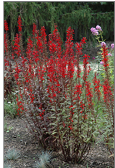
Black Truffle Cardinal Flower in bloom