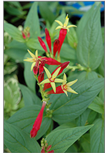
Indian Pink flowers

Indian Pink is recommended for the following landscape applications;