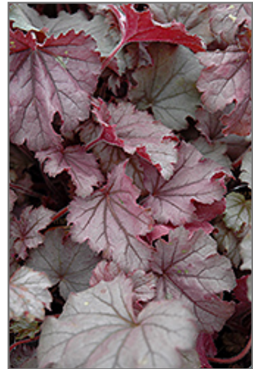
Little Cuties Sugar Berry Coral Bells foliage

Little Cuties Sugar Berry Coral Bells is recommended for the following landscape applications;