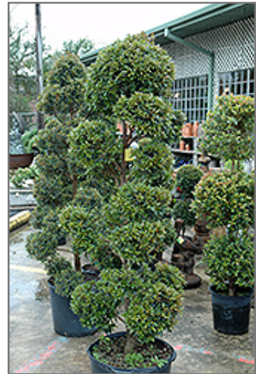
Brush Cherry

Brush Cherry is recommended for the following landscape applications;