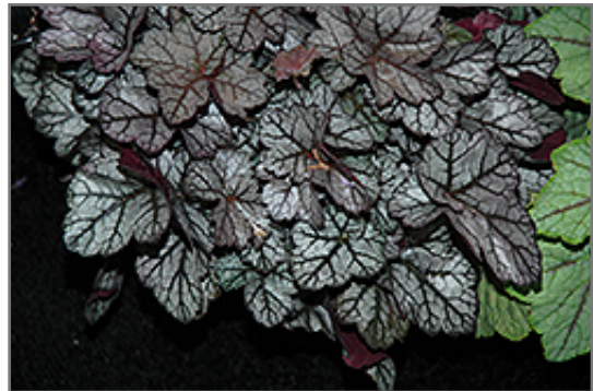
Glitter Coral Bells foliage