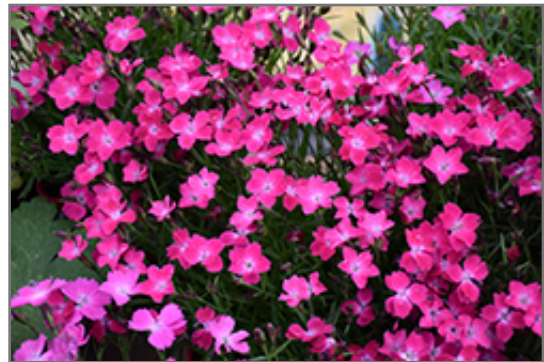
Kahori Pink Pinks flowers