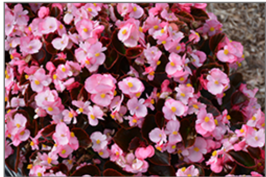
Nightife Pink Begonia flowers