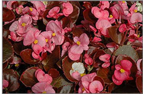
Nightife Rose Begonia flowers

Nightife Rose Begonia is recommended for the following landscape applications;