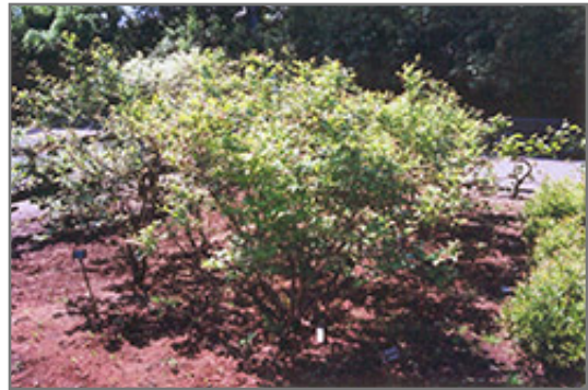
Northland Blueberry