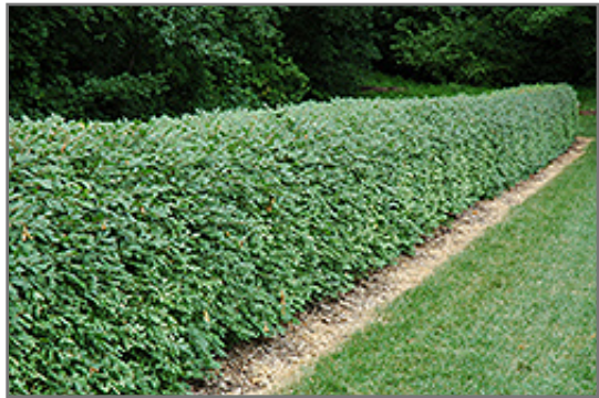
Winged Burning Bush

This shrub performs well in both full sun and full shade. It is very adaptable to both dry and moist locations, and should do just fine under average home landscape conditions. It is not particular as to soil type or pH. It is highly tolerant of urban pollution and will even thrive in inner city environments. This species is not originally from North America.