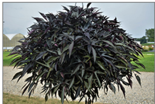
Illusion Midnight Lace Sweet Potato Vine