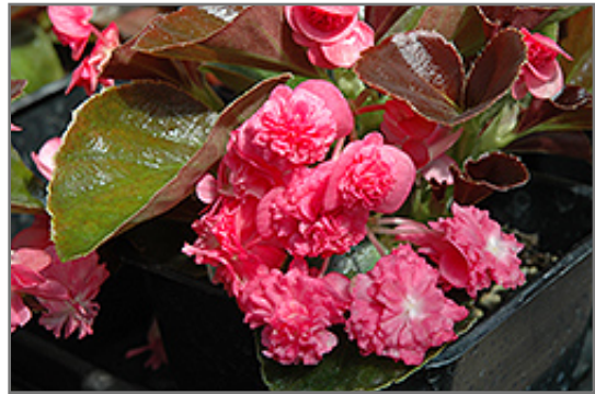
Doublet Rose Begonia flowers