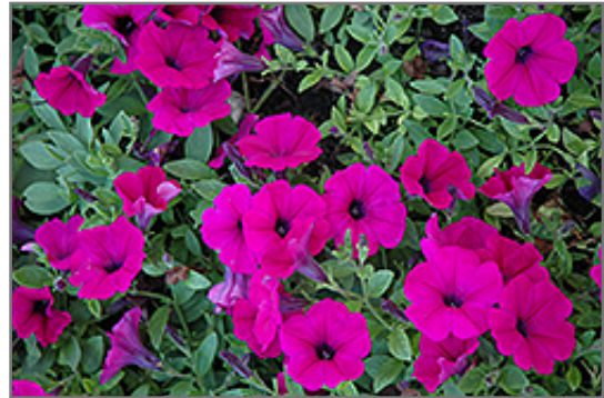
Wave Purple Classic Petunia flowers