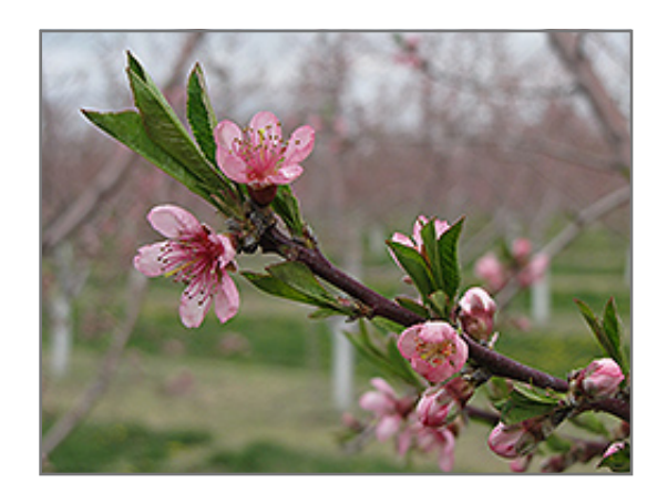
Nectarine flowers

Nectarine is blanketed in stunning clusters of fragrant pink flowers with white overtones along the branches in early spring, which emerge from distinctive rose flower buds before the leaves. It has dark green deciduous foliage. The narrow leaves turn yellow in fall. The fruits are showy red drupes with buttery yellow variegation, which are carried in abundance in mid summer. The fruit can be messy if allowed to drop on the lawn or walkways, and may require occasional clean-up.