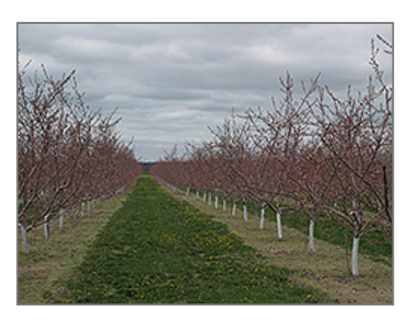
Nectarine in bloom