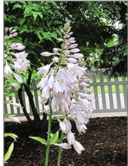
Key West Hosta flowers